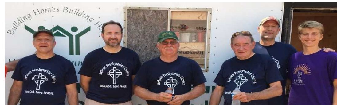
Hebron's GVA Serve Day Volunteers for Habitat for Humanity

An ice cream social will follow afterward—don't forget to bring your family and friends!